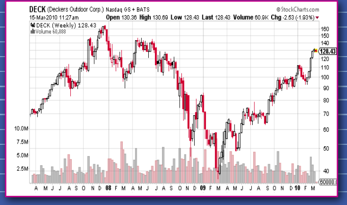
Closing prices for Deckers Outdoor Corporation. (NYSE:JJSF)